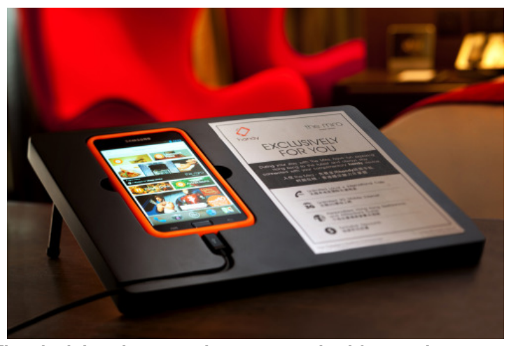
The sleek handy smartphone, a standard feature in every room of Hong Kong's first Design Hotels™ property, can be used on the go for complimentary international calls and unlimited Wi-Fi in the city