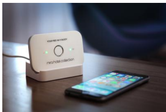
The sleek, free, portable “Wi-Fi Buddy” is a seamless on-the-go connectivity solution for modern travellers staying at Mira Hotel Collection hotels