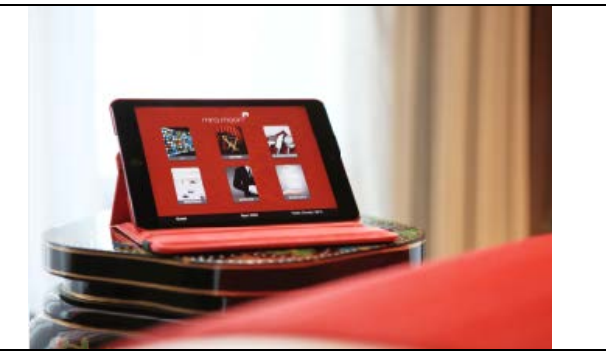
In-room iPad mini

Download high-resolution images at: https://we.tl/ZIM7v6h4nC