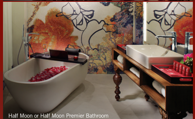
Half Moon or Half Moon Premier Bathroom