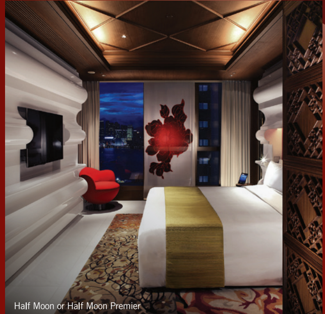
Half Moon or Half Moon Premier

Inspiration for the interior was also taken from traditional Chinese craftsmanship. Ceramics, carved timber and cut crystal are used throughout, creating a cultural mix which is made relevant today with a warm color palette of black, white, dark brown, red and gold.