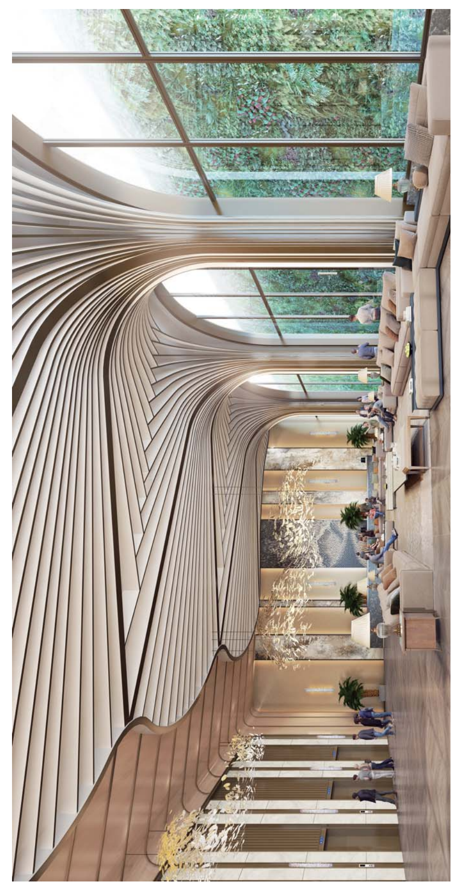
Floor-to-floor height of the reception hall of the New Hotel measures 9 metres, highlighting the hotel's deluxe 5-star status. (Artist's impression for illustration purposes only)